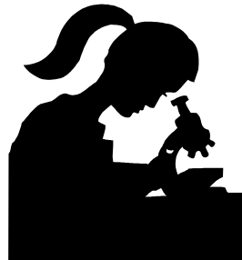
Learn how to document test data in OTP 102!

ophthalmic medical personnel; basic ocular anatomy and physiology; written and oral communication systems in health care; optical calculations; OSHA standards and aseptic technique; basic examination skills; instruments in the oph-