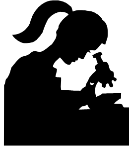
Learn how to document test data in OTP 102!